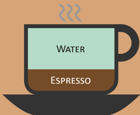
All Americano [all uh-mer-i-kan-oh]