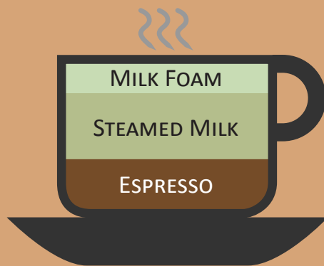
Caffé Latte [caf-ay lah-tey]