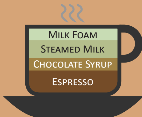
Caffé Mocha [caf-ay moh-kuh]