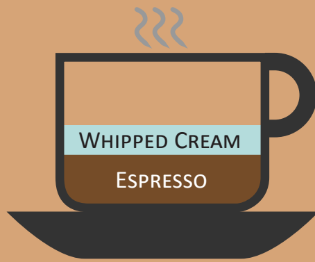
Espresso con Panna [ess-press-oh kon pawn-nah]